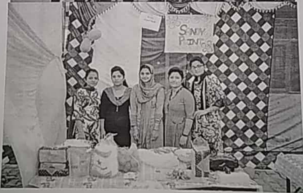
Entrepreneurship activity named "Rs. 1000 Carnival" for the students on 11th October-2019 in the college premises.

DM DEPUTY DIRECTOR JKGPTU CAMPUS MASHARPUR.