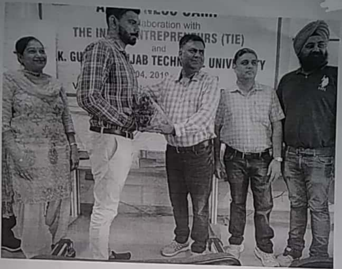
Workshop on EAC was organised at the campus on Sept 04, 2019